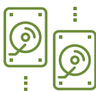
Backup & Recovery